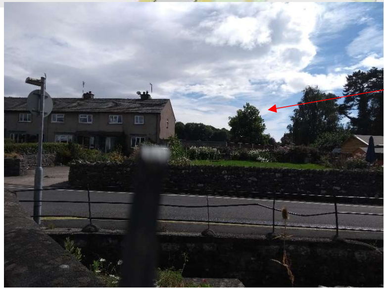
Location of tulip tree